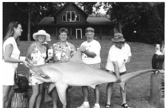
Margaritaville (actual dock censored)