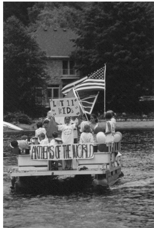
Anthems of the World