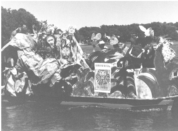
Eagle Boat – “Lion King”