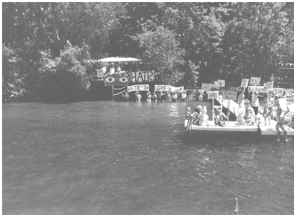
Eager Beaver – “Hair”