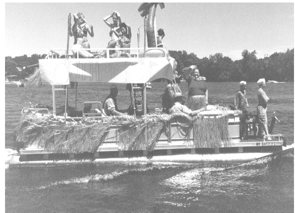
Honorable Mention – “South Pacific”