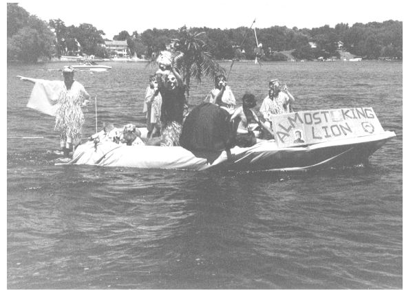
Honorable Mention – “Lion King”