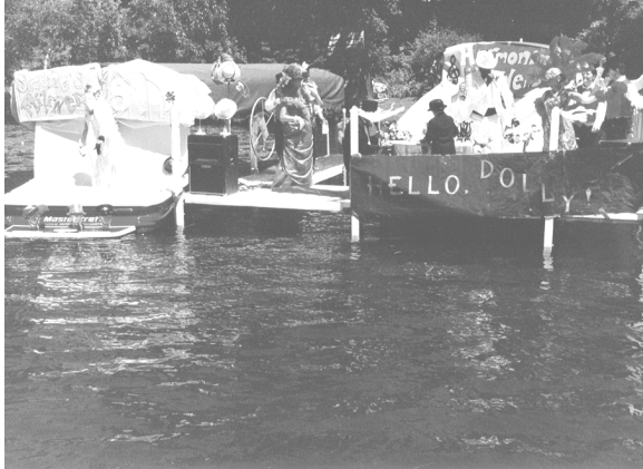
Eagle Dock – “Hello Dolly”