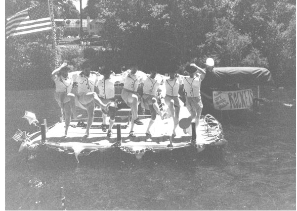
Shark – “Rockettes”