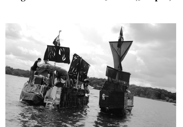
Eagle Boat – "Pirates of the Carribbean" (Novacyks and Raineys – tie)