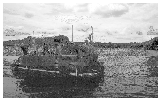
Honorable Mention – "Tarzan" (Szalapskis)