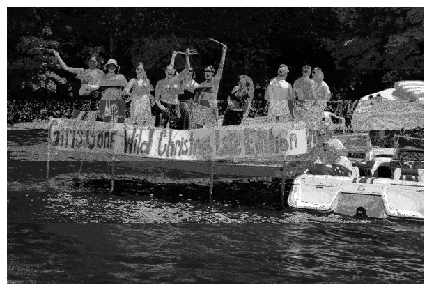
Shark – "Girls Gone Wild Christmas Lake Edition" (Larsons)